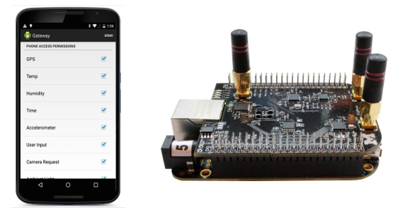
Figure 2: Android and Generic Access Point gateways.

Our gateway protocol supports two modes of interaction between the BLE device and the gateway: connectionlessand profile-forwarding, as shown in Figure 1. The first, connectionless, allows for very brief communication windows with very small payloads (eight bytes) and is optimized for extremely low energy operation. All forwarding parameters and data are encoded in a single BLE advertisement packet. The BLE device wishing to transmit to the Internet broadcasts a single packet that any gateway can receive, process, and forward to the correct destination. This method effectively represents the minimum requirements for offloading and forwarding data via BLE.