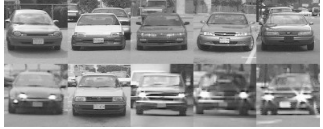
Figure 2: Positive training samples after preprocessing.

Finally, we use the Haar feature-based cascade classifier driven by the AdaBoost algorithm to build the car detection model. We use the OpenCV computer vision library to implement WalkSafe. The classifier building al-