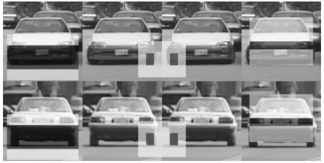
Figure 4: Examples of Haar-like features extracted from the car dataset.

In this section, we discuss initial results from the evaluation of the car detection model and the WalkSafe prototype. A near full version of the WalkSafe App can be downloaded from the Market. We implemented WalkSafe application for Android 2.3.4 operating system and tested it on Google Nexus One, which is equipped with 1 GHz Qualcomm Snapdragon QSD8250 CPU, has 512 MiB RAM memory, an accelerometer (which WalkSafe uses to rotate images) and a back facing camera capable of video capture at 20 frames per second with 720x480 pixel resolution. The WalkSafe prototype is implemented in Java and leverages the OpenCV (Open Source Computer Vision) library for computer vision algorithms [1]. In what follows, we describe the performance of two Haar cascade car detection models with