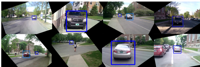
Figure 6: True positive detections in real world scenario using WalkSafe on the phone with different user phone orientation.

be preserved when pedestrian phone users are walking along the street on the sidewalk. The high rate of correctly detect cars makes us confident that WalkSafe is a workable, practical and robust approach to detecting on coming cars under real-world conditions (e.g., with different cars, users, user phone orientation, user mobility and light conditions).