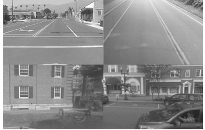
Figure 3: Negative training samples after preprocessing.

gorithm uses the positive and negative samples. We build a classifier that consists of several simpler classifiers (stages) based on Haar-like features. Haar-like features are a well-known technique that make feature extraction from images computationally easy. Haar-like features consider adjacent rectangular regions in a detection window, sum up the pixel intensities in these regions and calculates the difference between them – the resulting value is an Haar-like feature. The classifiers at every stage of the cascade pipeline are complex themselves being built out of basic classifiers, which “vote” on the classification of the same sample. The votes are weighted according to the Gentle AdaBoost algorithm, which is known to work well for this kind of applications [1, 19]. We train the cascade classifier on 20 stages. In each stage, a weak classifier is trained, in which a 0.999 hit rate and 0.5 false alarm rate are preserved. More specifically, we use a single layer of decision trees as the weak classifier in each stage. We use two kinds of decision trees as the weak classifier: one is the stump decision tree, which is a tree that has only one split node, and the other is Classification And Regression Tree (CART) with two split nodes. The accuracy of the two cascade classifiers are evaluated in the evaluation section, discussed later in the paper.